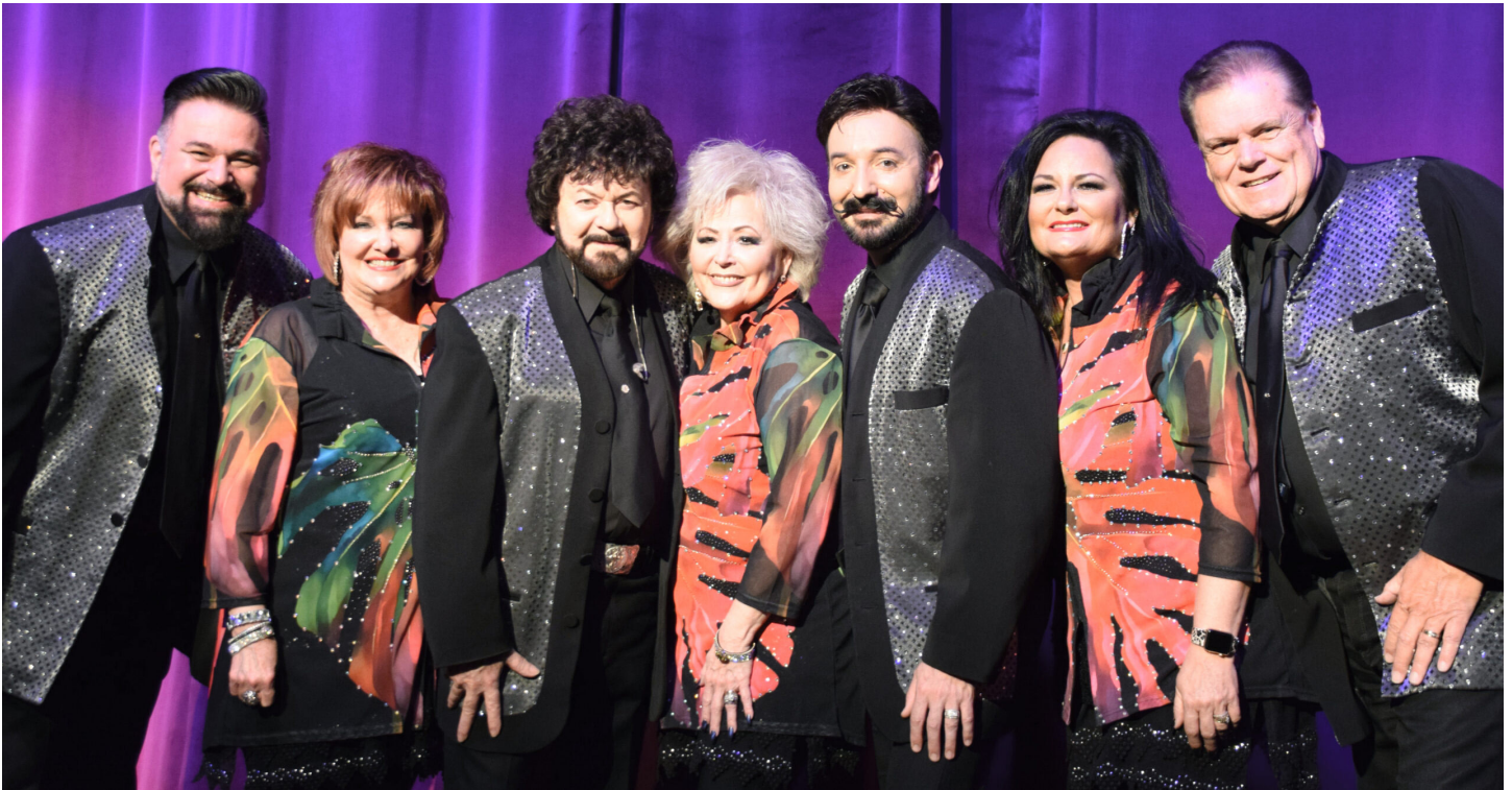
The Blackwoods will perform for ActsFest participants on July 15.